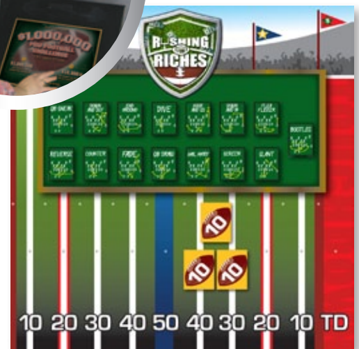
8' X 8' GAME SHOW